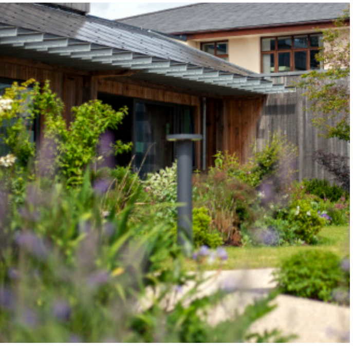
Just 22% of our funding comes from the NHS