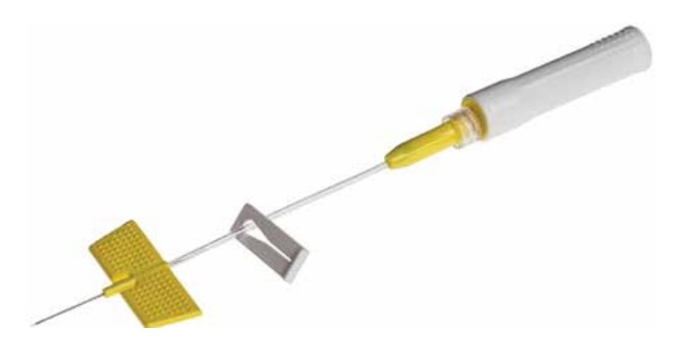
This is a single port Saf-T-intima line, with Bionector 'bung'

A line called a Saf-T-Intima is a simple device that sits under the skin, usually on the arm, so that when an injection is given it is only injected into the device and not directly into the skin.